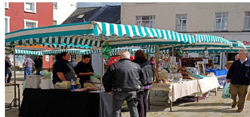
Haverfordwest Farmers' Market

Downriver on the west bank of the river are the ruins of an Augustinian Priory that have recently been excavated and repaired. They occupy a pleasant setting beside the river, a short walk from the town centre.