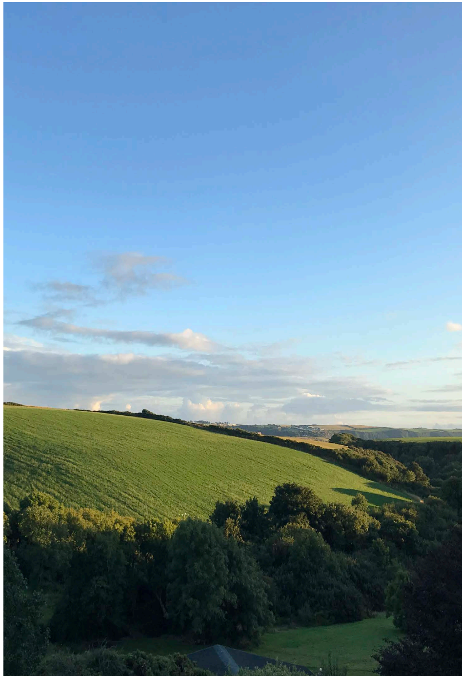
Timber Hill, Broad Haven, Haverfordwest, SA62 3LZ