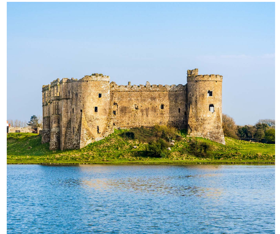
Carew Castle's rich history spans over 2,000 years and tells of knights of the realm, kingmakers, Elizabethan intrigue and Civil War devastation.

Set in a stunning location overlooking a 23-acre Millpond, the Castle is one of the most architecturally diverse in Wales; from the west a Norman fortress, yet from the north a splendid Elizabethan mansion.