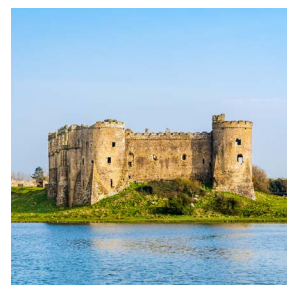
CAREW CASTLE 25 mins drive from Timber Hill