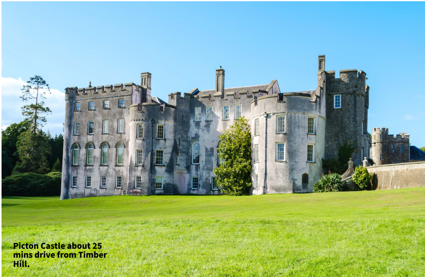
Picton Castle about 25 mins drive from Timber Hill.