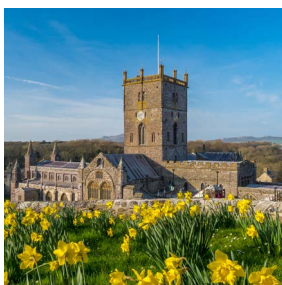
ST DAVIDS 35 mins drive from Timber Hill

CREATING MEMORIES THAT WILL LAST FOREVER.