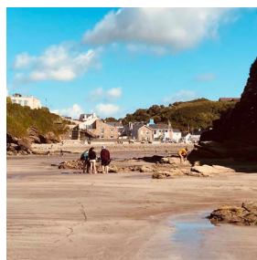
LITTLE HAVEN 10 mins drive from Timber Hill